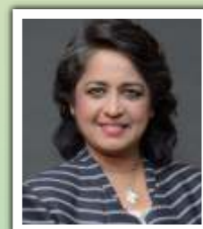
Dr. Ameenah Faqim Former President, Republic of Mauritius, Port Louis