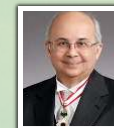
Dr. Ismail Serageldin Director, Cairo Institute and Former Vice President, World Bank