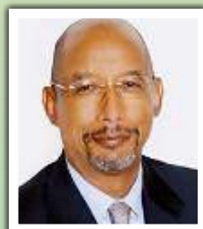
Dr. Ibrahim Mayaki Former Prime Minister, Republic of Niger