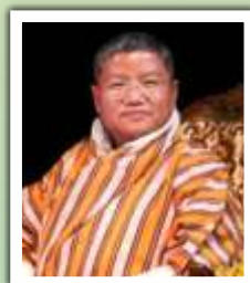
H.E. Kinzang Dorji of Bhutan Hon'ble former Prime Minister of Bhutan