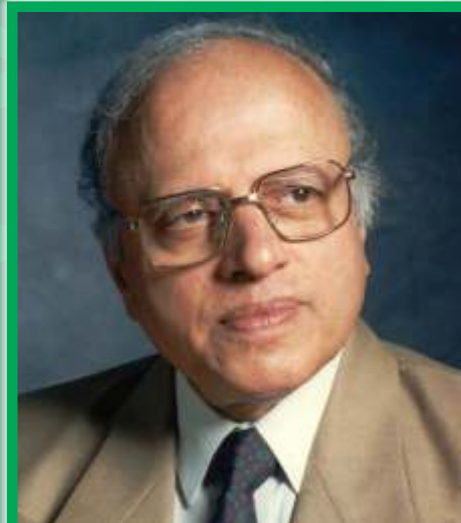
Prof. MS Swaminathan Pioneer of India's Green Revolution