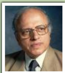
Prof. MS Swaminathan Pioneer of India's Green Revolution and Founder, MSSRF, Chennai