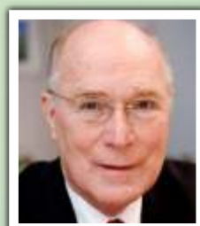
Dr. Rudy Rabbinge Special Envoy – Food Security, Government of Netherlands