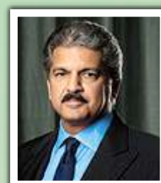
Mr. Anand Mahindra Chairman, Mahindra Group